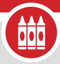
TABLE TOP ACTIVITIES